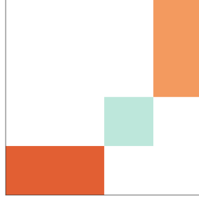
Figure 2: Example for \mathbf{X} = [0, 1] with three components (the diagonal is displayed top-left to bottom-right, as for matrices). Here \Lambda_{\text{low}} , \Lambda_{\text{diag}} , \Lambda_{\text{upp}} each have one element.

the other is in \Lambda_{\text{upp}} . We note that the collections (A_\lambda)_{\lambda \in \Lambda_{\text{low}}} and (B_\lambda)_{\lambda \in \Lambda_{\text{upp}}} coincide. For the subsequent construction, it will be important that